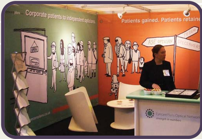
>> The ASE Optrafair stand