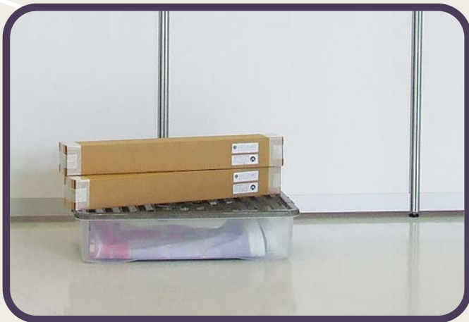
>> Two boxes of Shell-Clad fixings and one for the fabric graphics