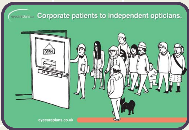
>> The simple graphic used on one of the walls