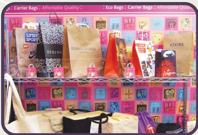
>> Crazy:Bags design detail