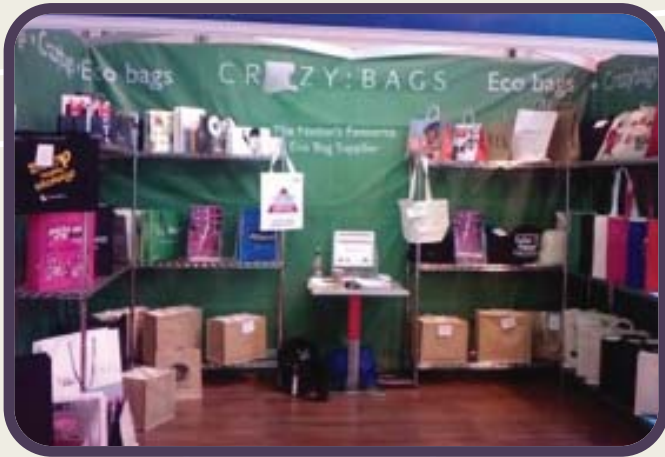
>> Crazy:Bags before