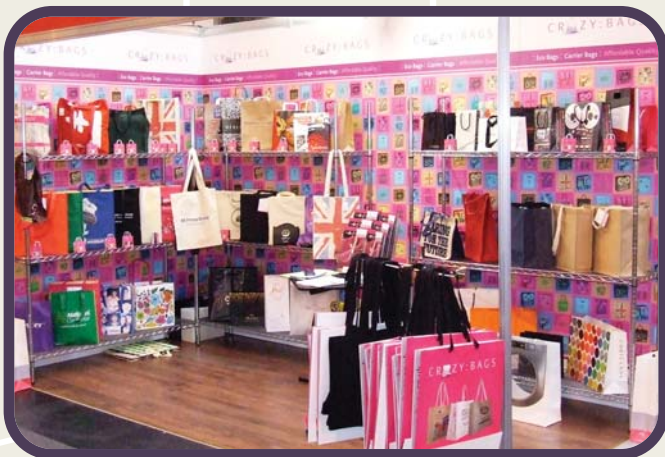
>> Crazy:Bags after