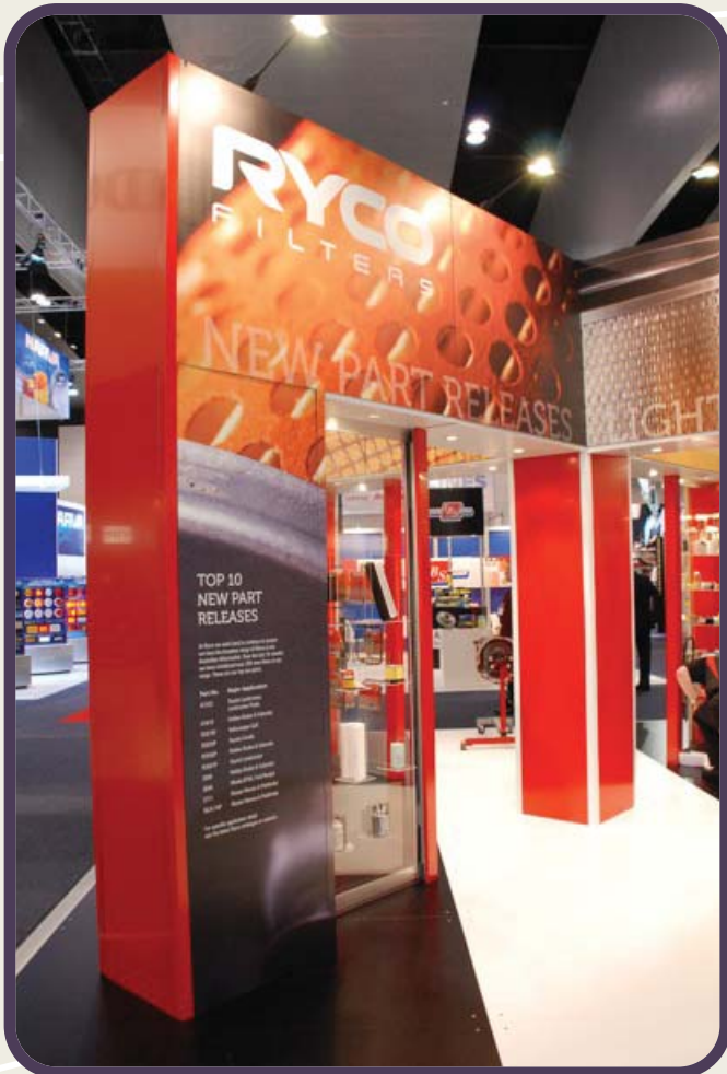
» RYKO automotive filters