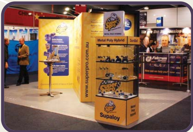
» Supaloy automotive parts